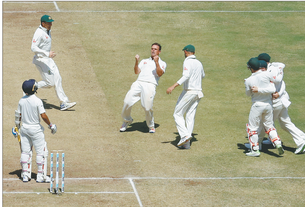
Australia's Steve O'Keefe (3rd left) celebrates the wicket of India's Ajinkya Rahane on the second day of the first Test at the MCA Stadium in the western Indian city of Pune on Friday.

Replying to Australia's 260, the world's top-ranked side, unbeaten in their previous 19 Tests, lost their last seven wickets for 11 runs as