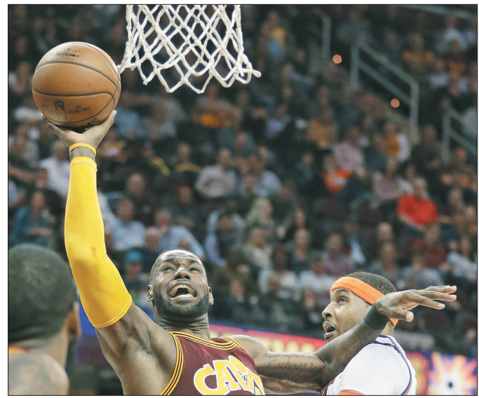
Cleveland Cavaliers' LeBron James drives to the basket against New York Knicks' Carmelo Anthony in the first half of their NBA basketball game in Cleveland on Thursday.

Courtney Lee had 25 points for New York, which has lost six of seven and is 12th in the Eastern Conference playoff race.