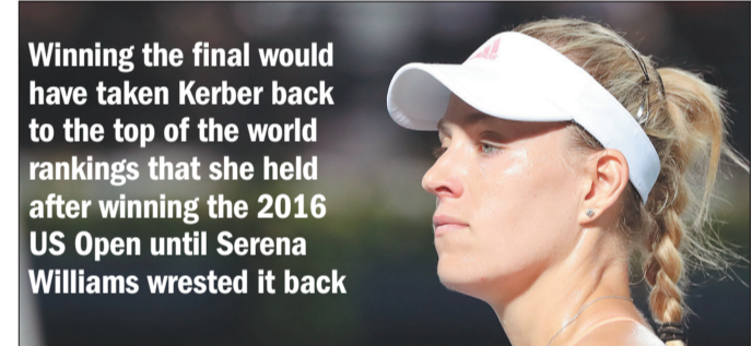
Angelique Kerber of Germany looks on during her semi-final match against Elina Svitolina of Ukraine in Dubai on Friday.

"She definitely was a tricky opponent. I knew going into it that she was going to be difficult. She mixes the pace up. She really tries to break your rhythm. I was really pleased with how I was playing. I tried to stay aggressive and tried to mix it up, as well."